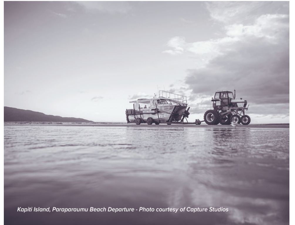
Kapiti Island, Paraparaumu Beach Departure

Check out discoverwhanganui.nz and Discover Whanganui on Facebook for all your information about Whanganui.