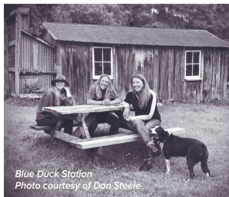
Blue Duck Station

No refunds are paid at the Whanganui i-Site Visitor Centre.